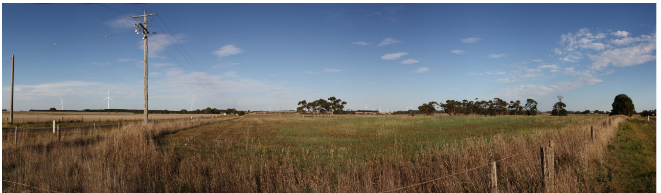
Predicted view of the Willatook Wind Farm looking ESE from the intersection of the Woolsthorpe-Heywood and Hamilton-Port Fairy Roads.

Wind Prospect has begun to gather detailed site information regarding the project area and the impact assessment and would like to share this information with the local community. Two open days will be held at the end of October/early November to provide an opportunity for the community to learn more about the proposed project and to provide input to the development process. The events will be advertised locally in early October, or if you are interested in attending the open day you can contact Wind Prospect to be added to the mailing list. We very much look forward to meeting more of the local community and hearing your views.